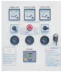
Control panel for open style

The Model DSE702 is a Manual Engine Control Module designed to control the engine via a key switch and pushbuttons on the front panel. The module is used to start and stop the engine and indicate fault conditions, automatically shutting down the engine and indicating the engine failure by LED, giving true, first up fault annunciation.