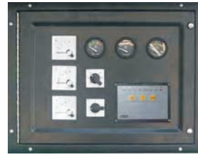
Control panel for soundproof

The DSE704 is an Automatic Mains Failure module with generator monitoring, protection and start facilities. It utilises advanced surface mount construction techniques to provide a compact yet highly specified module. This model can start the unit automatically when the MAINS failure and control the ATS switch to the genset. Operation of the module is via three pushbuttons mounted on the front panel with STOP, MANUAL and AUTO positions.