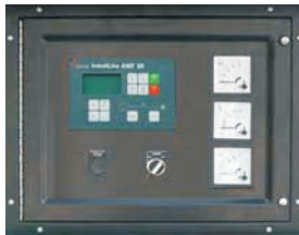
Control panel for soundproof

The AMF25 is an Automatic Mains Failure module with generator monitoring, protection and start facilities. The controller has a large LCD screen, display the generator's each parameter, running and alarm information, and cooperate with the off/replacement, the mode switch ,the start/stop and the LED indicator light, makes the user easy to operate and maintain the generator.