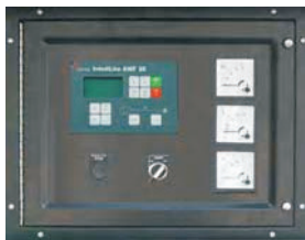
Control panel for soundproof

The AMF25 is an Automatic Mains Failure module with generator monitoring, protection and start facilities. The controller has a large LCD screen, display the generator's each parameter, running and alarm information, and cooperate with the off/replacement, the mode switch ,the start/stop and the LED indicator light, makes the user easy to operate and maintain the generator.