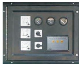
Control panel for soundproof

The DSE704 is an Automatic Mains Failure module with generator monitoring, protection and start facilities. It utilises advanced surface mount construction techniques to provide a compact yet highly specified module. This model can start the unit automatically when the MAINS failure and control the ATS switch to the genset. Operation of the module is via three pushbuttons mounted on the front panel with STOP, MANUAL and AUTO positions.