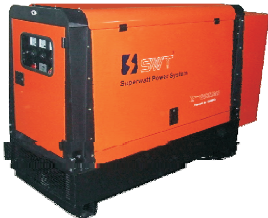
The picture only for reference