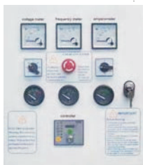
Control panel for open style

The Model DSE702 is a Manual Engine Control Module designed to control the engine via a key switch and pushbuttons on the front panel. The module is used to start and stop the engine and indicate fault conditions, automatically shutting down the engine and indicating the engine failure by LED, giving true, first up fault annunciation.