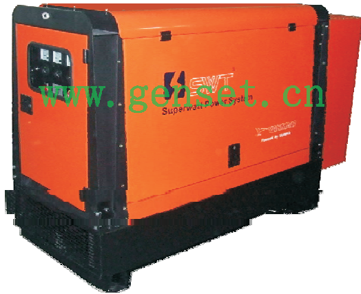
The picture only for reference