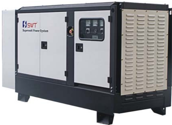
The picture only for reference.