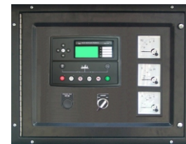
The controller made in UK DEEPSEA genset controller