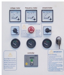
The controller made in UK DEEPSEA genset controller