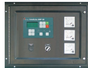
The controller made in Turkey Comap genset controller