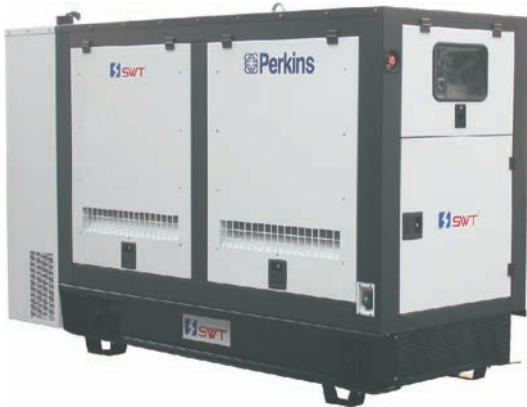
The picture only for reference