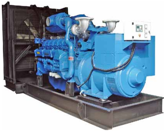
The picture only forreference