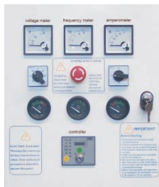
The controller made in UK DEEPSEA genset controller