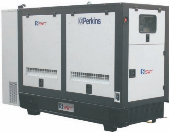
The picture only forreference