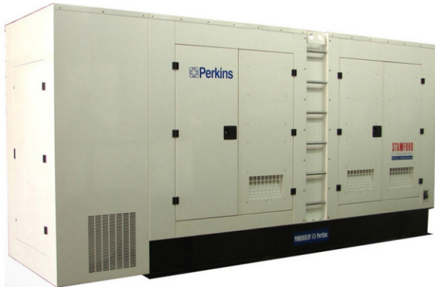
The picture only forreference