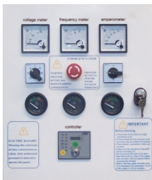
The controller made in UK DEEPSEA genset controller