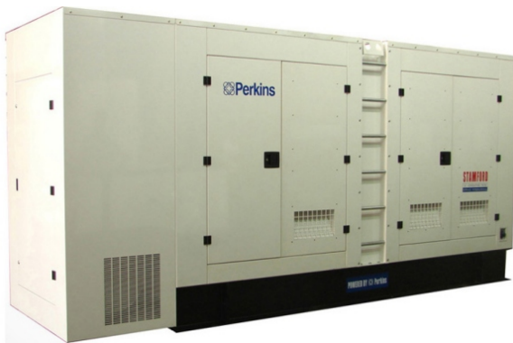
The picture only for reference