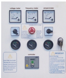
The controller made in UK DEEPSEA genset controller