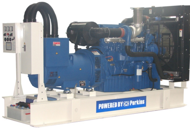
The picture only for reference