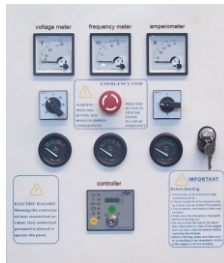
The controller made in UK DEEPSEA genset controller