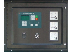
The controller made in Turkey Comap genset controller