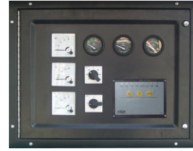
The controller made in UK DEEPSEA genset controller