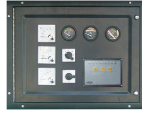
The controller made in UK DEEPSEA genset controller