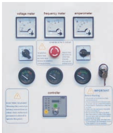
The controller made in UK DEEPSEA genset controller