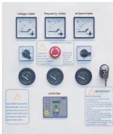
The controller made in UK DEEPSEA genset controller