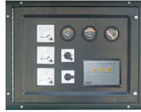
The controller made in UK DEEPSEA genset controller