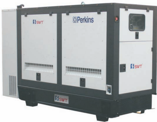
The picture only for reference