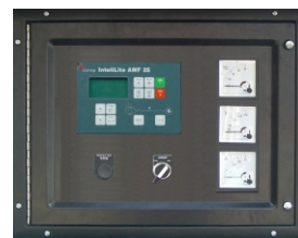
The controller made in Czech Comap genset controller