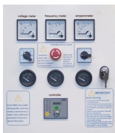
The controller made in UK DEEPSEA genset controller