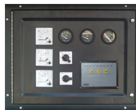
The controller made in UK DEEPSEA genset controller