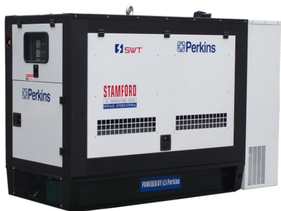
The picture only for reference