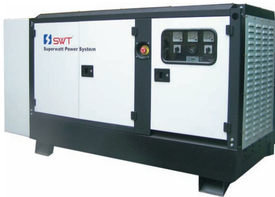
The picture only for reference