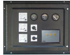
The controller made in UK DEEPSEA genset controller