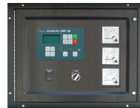
The controller made in Czech Comap genset controller