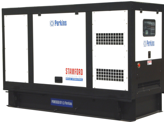
The picture only for reference