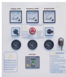
The controller made in UK DEEPSEA genset controller