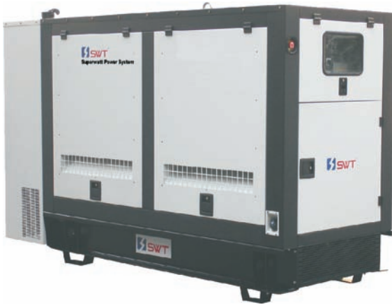
The picture only forreference